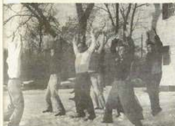
"P. T." on a bitter cold morning in the snow.