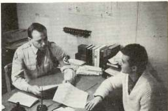
National Secretary checks completed, notarized blank.