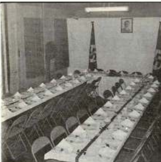
Banquet Room, Vinland Hall, Chicago.