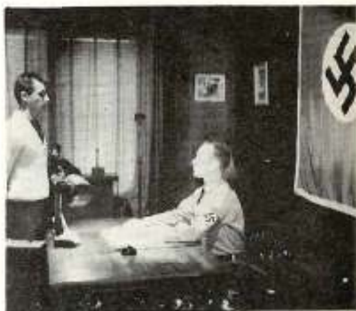
Being logged in by Duty Officer