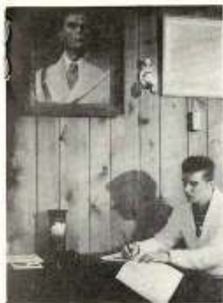
Filling out lengthy application blank.