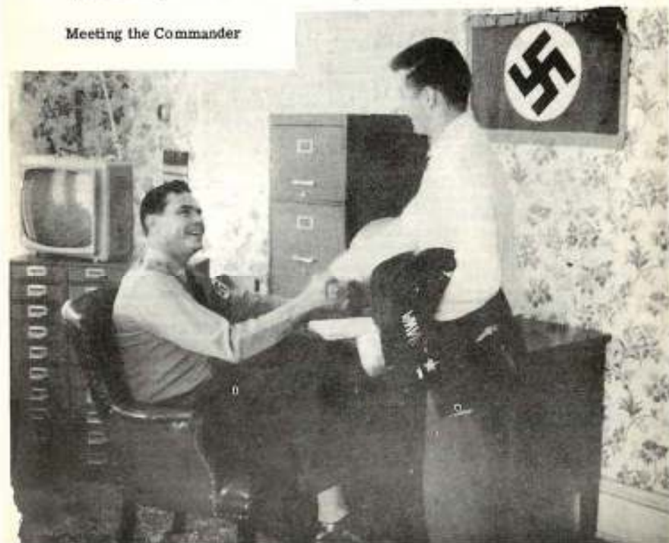
Meeting the Commander